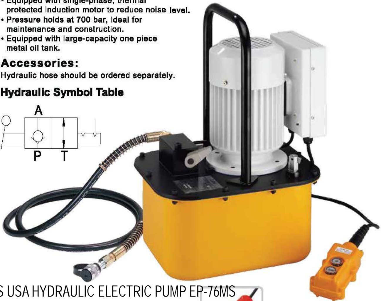
KUDOS USA HYDRAULIC ELECTRIC PUMP EP-76MS